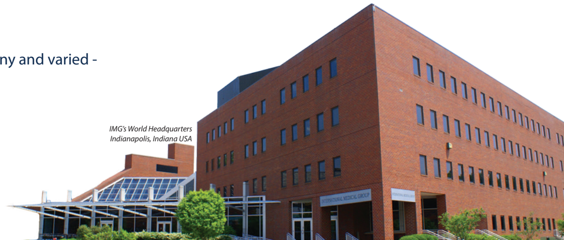
IMG's World Headquarters Indianapolis, Indiana USA

The reasons to travel abroad are many and varied - that's why our products are too.